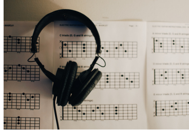
Drama & Music