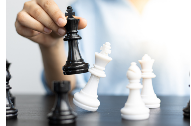
Clubs . . . .